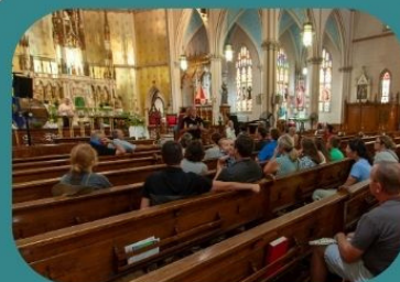
Pilgrimage to Historic Ste. Anne de Detroit