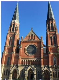
Ste. Anne de Detroit