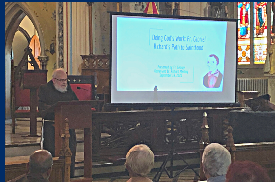
FGR's Path to Sainthood