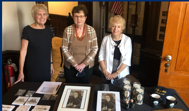
FGR items for sale at the Ste. Anne gift shop