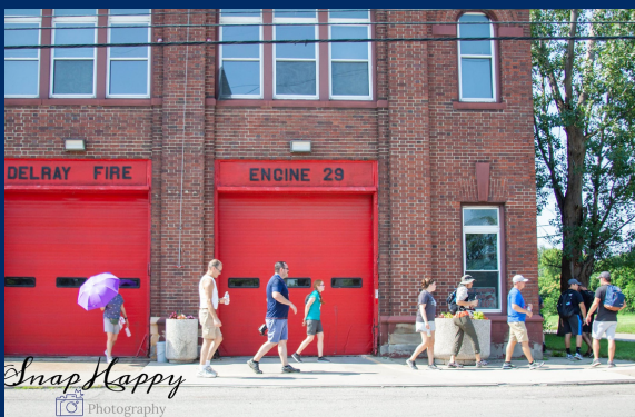
Rise from the Ashes Pilgrimage