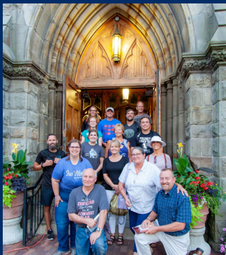
Rise from the Ashes Pilgrimage