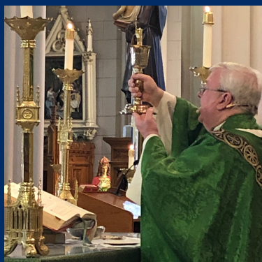
Celebrating Mass with FGR's Chalice