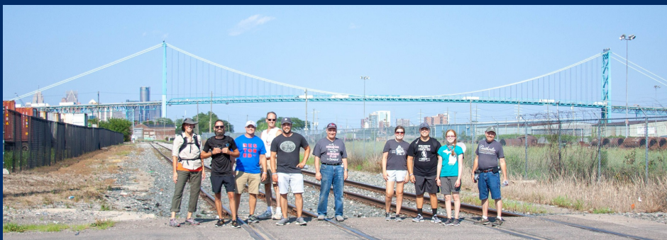
Rise from the Ashes Pilgrimage