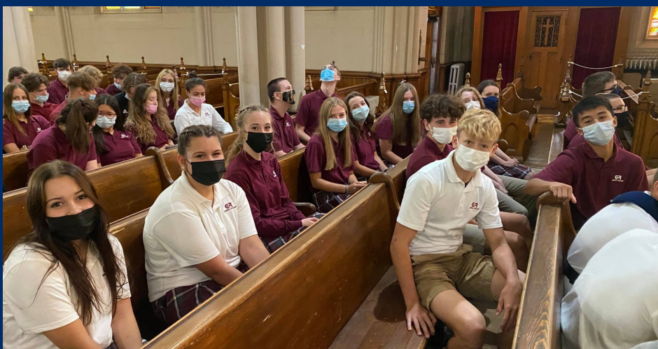
Students from Gabriel Richard High School attend Mass and the Annual Exhibit